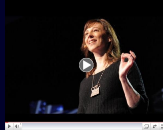
Susan Cain: The power of introverts