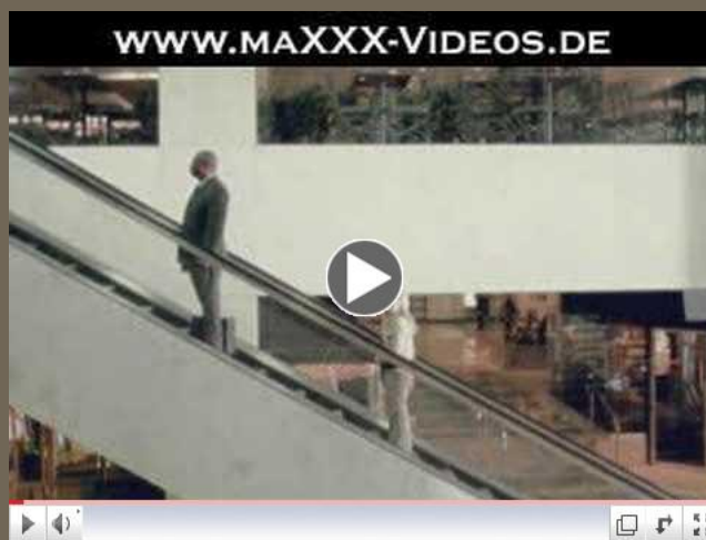
Stuck on an escalator

Here is a funny little ice breaker for your conversation with your child, and 7 strategies to help your GT kids cope .